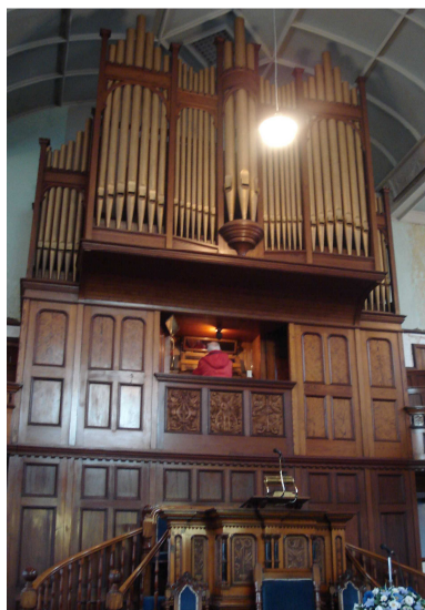
Tabernacle Congregational Chapel