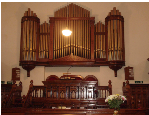
Hyfrydle Presbyterian Chapel

The final stop of the day was Hyfrydle Presbyterian Chapel. Originally, the chapel building faced the side street, but members wanted more prominence and so the chapel was turned around so that the entrance faced the main road. The chapel was built by local builder William Williams, a renowned perfectionist, who used wood brought to Holyhead from Canada in the construction. Built during the period 1886-1888, only one window is no longer original, which shows the quality of the workmanship and of the wood used. In recent years, the vestry has been re-roofed and the organ machinery has been serviced by specialists. This led to the replacement of the walls beneath the organ. The chapel is due to be painted during 2010.