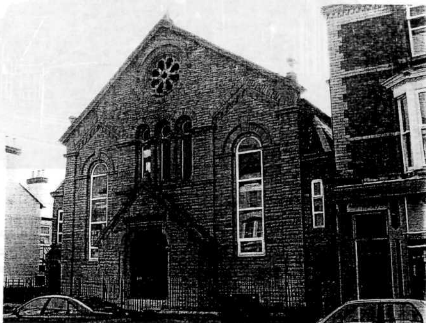
Tabernacle / Islamic Cultural Centre