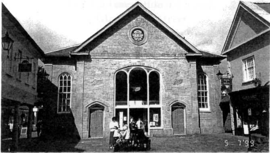
The former Bethel Chapel as it is today.

Bethel is a stone building in classical style and once contained seating for 800 people. It was at the time the largest in the town.