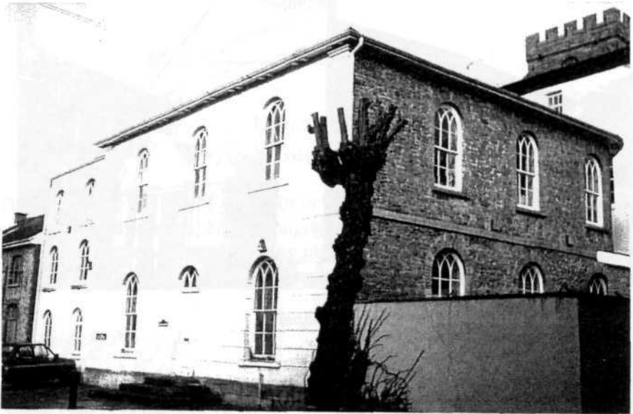
The Old Museum.