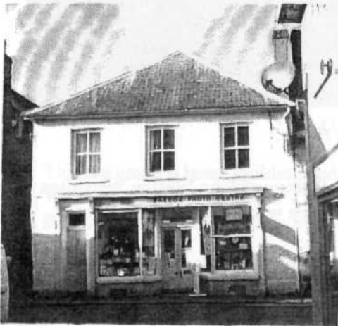
Former Tabernacle as it is today.