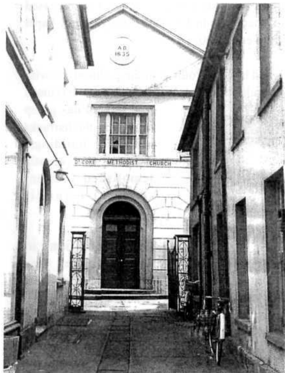
Dr Coke's Methodist Chapel in 1960.

The increasing anglicisation of the borough brought about a decline in the use of Welsh and the need for a proper sanctuary soon arose. A chapel was erected at the corner of Free Street and Little Free Street in 1770. It was revamped in 1815 and was jointly used at that time by English and Welsh Wesleyan societies of the town, but in 1834 a new Wesleyan chapel was built near the birthplace of Dr Coke at a cost of £2,000.