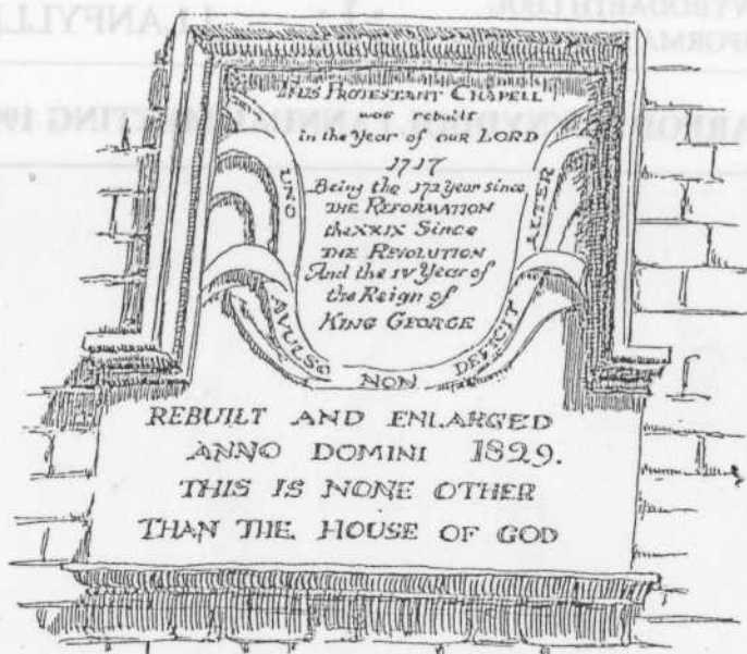
Pendref (Independent) Llanfyllin — Memorial Stone

depredations of Victorian improvers. Those wishing to see an unspoiled early 18th century interior must visit the church at Worthenbury in Maelor Saesneg - dedicated in the same year as St Myllin's.