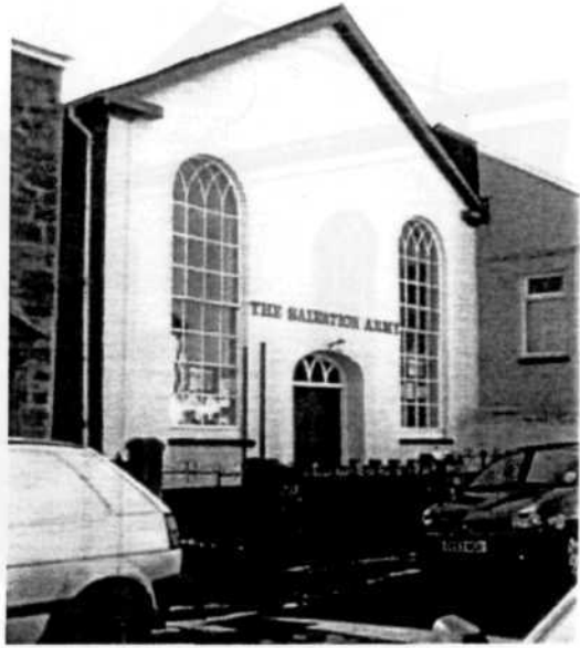
Salvation Army Chapel

The Salvation Army Citadel in Victoria Street was formerly the Assemblies of God Chapel. It was built in 1830 as a Primitive Methodist Chapel and listed grade II as a building of special architectural and historic interest in 1974. It has retained its external appearance although the interior has been modernised.