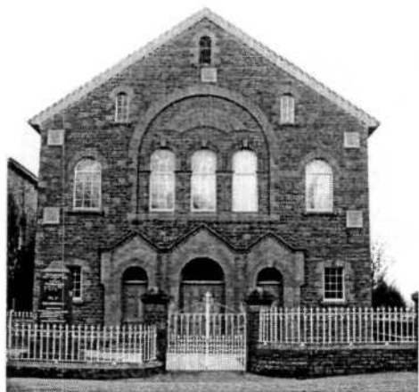
The new chapel, built 1898

As the population of the locality grew, so did the membership at Moriah, and by the 1890s the old