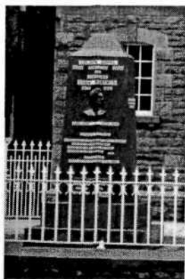
The Evan Roberts memorial